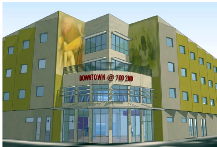
Architect's rendering of Main Entrance facing Southeast

The site is highly visible from all approaches to the intersection making this an excellent location to highlight public artwork that addresses the unique nature of this new workforce housing project. The proximity to the entire downtown area will provide an opportunity for the selected artist or team to create a landmark work describing a unique concept in affordable housing and environmentally sustainable design. The balcony, the planned café, the outdoor seating and ultimately the artwork itself should all work to bring the neighbors in, integrate the residents into the larger neighborhood and foster interaction among those who live and travel in proximity to the project.